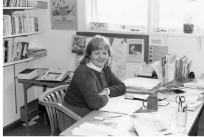
16th Annual Dorothy Berkson Writing Award in Gender Studies