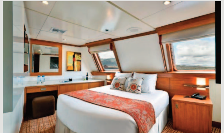
Boat Deck Stateroom