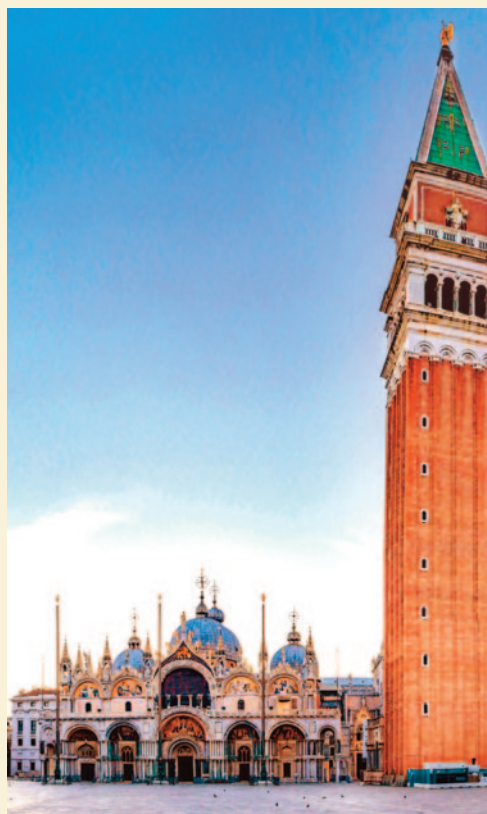
San Marco, Venice

NOT INCLUDED: Airfare; travel insurance; expenses of a personal nature; gratuities to shipboard personnel; any items not mentioned in the Program Inclusions.