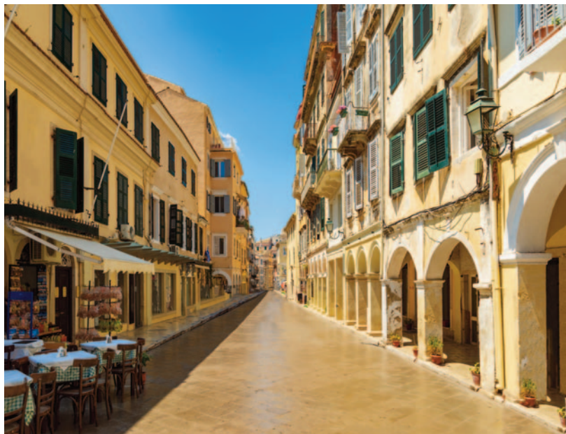
The old town of Corfu