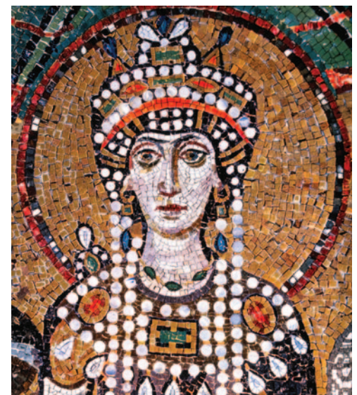
Detail of Byzantine mosaic, Basilica of San Vitale, Ravenna

Croatia's vibrant port city of Split, which started as a Greco-Illyrian settlement called Aspalathos. The city is centered around the the formidable Place of Diocletian, built in A.D. 295. An extensive structure, much of which is well preserved, the palace contains within its walls Split's medieval town, making it the only palace that has been continuously inhabited since Roman times. After touring this incredible site, a UNESCO World Heritage site, sail to nearby Hvar, one of Croatia's loveliest islands, where the architecture is unmistakably Venetian. Located within a small area by the seafront are the 17th-century Municipal Theater, the Venetian Loggia, and the Franciscan Monastery. Stroll leisurely the town's narrow lanes. Meals: B, L, D