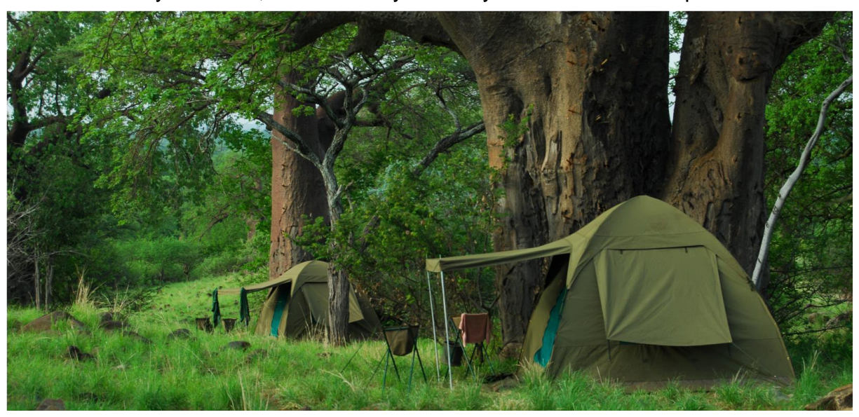
Night 7: Dorobo Tent Camp