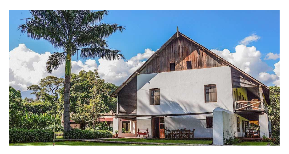
Night 1: Ngare Sero Lodge www.ngare-sero-lodge.com

Arrive at Kilimanjaro International Airport – Welcome to Tanzania! Our guides will meet us and transfer us to the Ngare Sero Lodge (less than one hour drive from airport). This lodge is situated amongst lush gardens, forest, and clear spring waters on the slopes of Mount Meru, the gateway to Tanzania's renowned national game parks. The Lodge has been adapted from an early colonial farmhouse built in the early 20th century and is one of the oldest family lodges in Arusha.