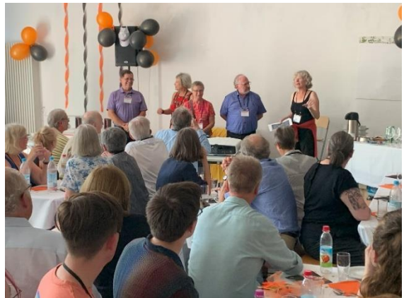
Studentenstadt Tour, Sept. 8, 2024