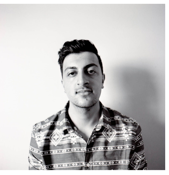
I don't feel as though I am appropriating African culture, it's just the fashian/trend. I certainly don't wear it with the intention of exploiting a group of people, it's just the tatest style.

As my confidence and desire for African designed apparel grows, I hope so will others.