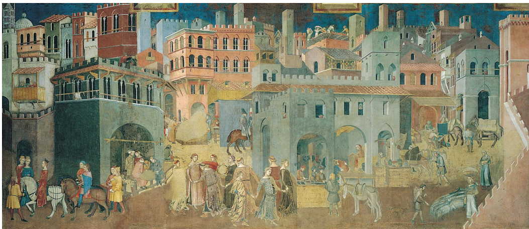
detail from Ambrogio Lorenzetti The Effects of Good Government in the City and in the Country , from a series of frescoes in the Palazzo Pubblico (Siena), 1338-39